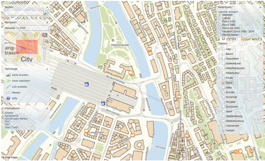
Fig. 3.2 Silverlight city map ( www.stadtplan.stadt-zuerich.ch )

REST API and integrated in a Silverlight GUI. Vector-based interactive objects, such as points of interest and borders, are placed over the raster background. The vector data in this example are stored in an Oracle Spatial database.